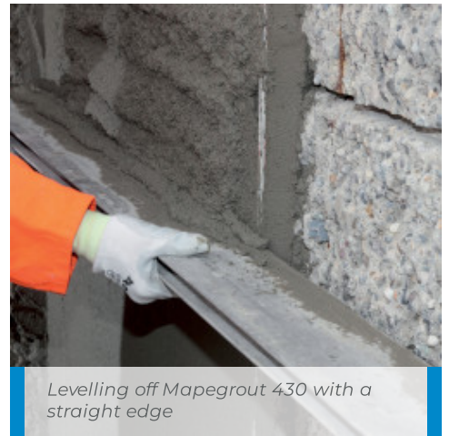
Levelling off Mapegrout 430 with a straight edge