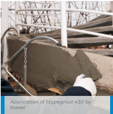
Application of Mapegrout 430 by trowel