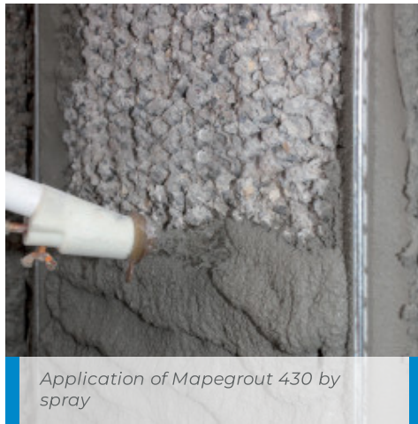
Application of Mapegrout 430 by spray