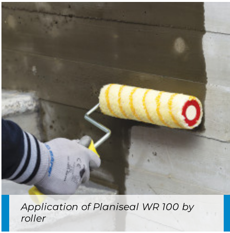
Application of Planiseal WR 100 by roller