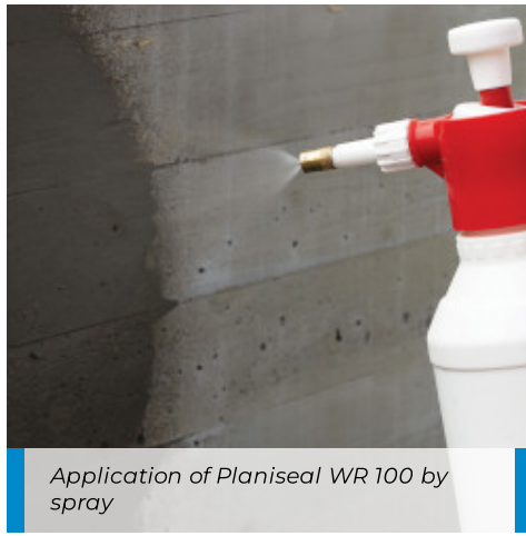
Application of Planiseal WR 100 by spray